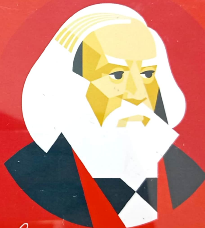
Viktor A. Sadovnichy